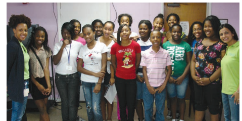
1st YARO Cohort of participants in Pinellas County

My APHA experience was wonderful! I was able to attend very interesting sessions at the conference. The atmosphere of the conference was great, and I could tell right from the beginning